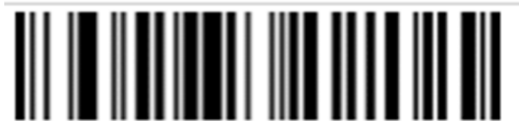
Beep after successful code reading disabled