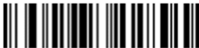
Startup sound enabled (default)