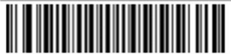
No Letter Conversion (Default)