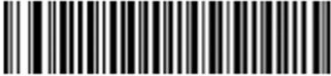
All Uppercase Letters