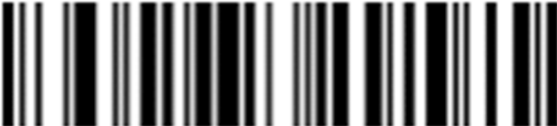
All sounds off