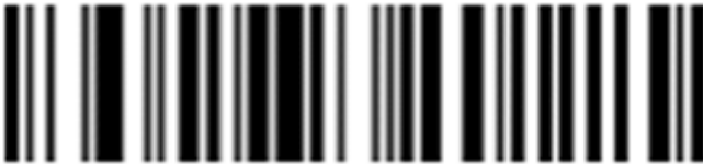
All sounds enabled (default)