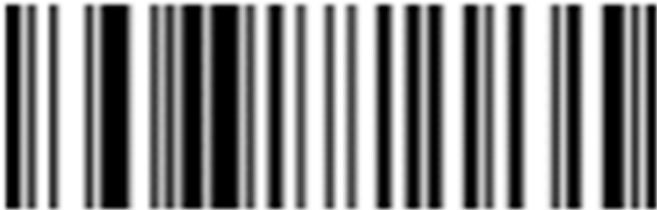
Check digit enabled (default)