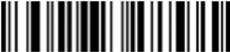
Sound frequency 2731Hz