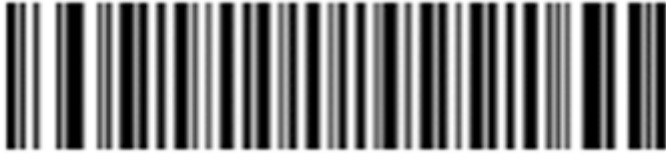
All lowercase letters