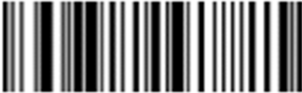
Read all code types enabled