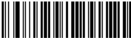
Removal of all prefixes set