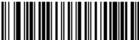
Suffix setting enabled